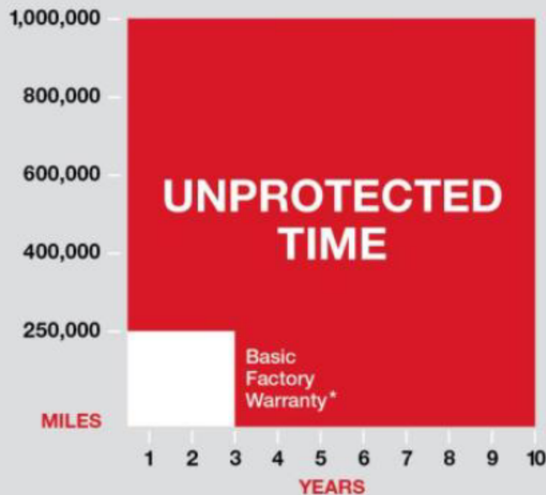
Example of Basic Warranty Coverage for New HD/MD Trucks